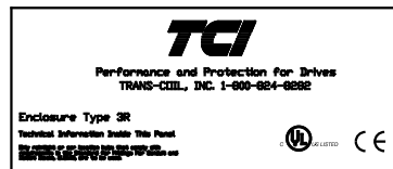
LABEL PLACED ON FRONT OF CABINET.